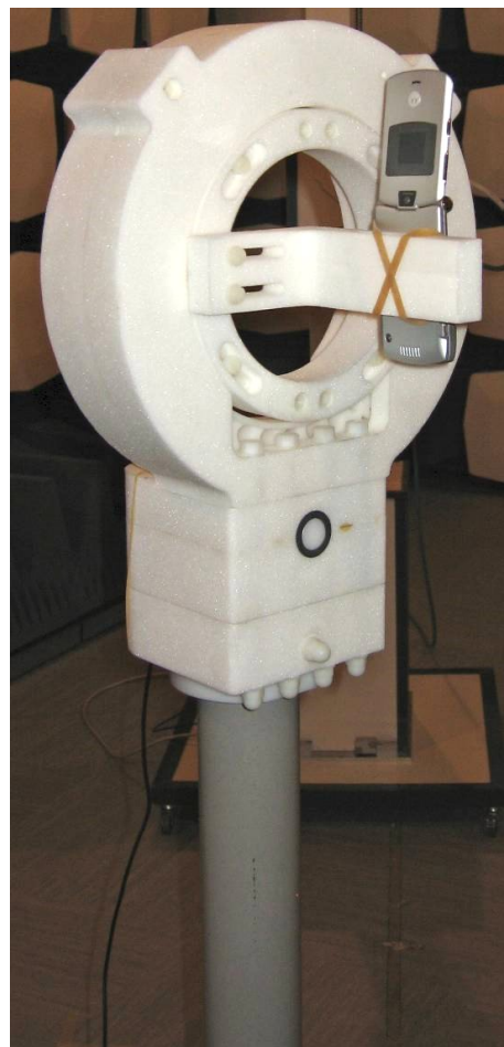
Fig.: Fixing of EUT at TD 1.5-2kg

Information presented enclosed is subject to change as product enhancements are made regularly. Pictures included are for illustration purposes only and do not represent all possible configurations.