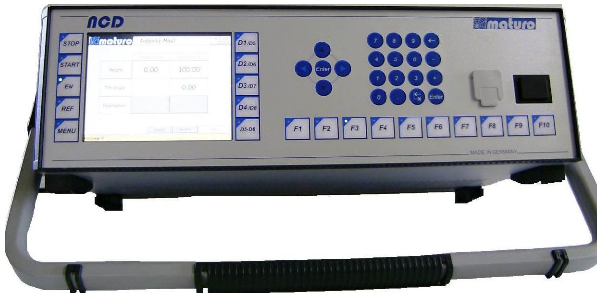
Figure: NCD with option "tip-up handle"

The new developed Multiple Control Device NCD is suited for the operation of up to 8 devices with multiple axis of motion. Those devices can be any combinations of antenna masts, turntables, cable guide rails or any other positioning equipment. This controller NCD permits the operation in manual, semi-automatic and remote control mode via IEEE 488.2 (GPIB bus), or optionally other interfaces, of multiple devices simultaneously.